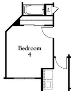
OPTIONAL BEDROOM 4