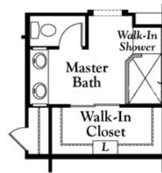
OPTIONAL MASTER BATH